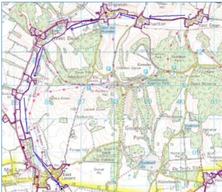
Figure 1 – schematic of Lavant sewerage system

Southern Water will continue to consult with representatives of these parties as part of the IRP development and implementation.